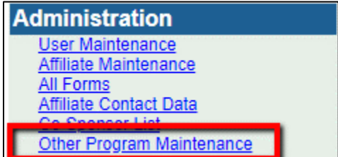
Figure 1. Link to Other Program Maintenance.

IRIS has basic functionality to track case enrollment in other programs. An RA user may create Program's by accessing the dashboard link to the "Other Program Maintenance" screen. The programs the RA creates may be used by an affiliate to track client enrollment in the program.